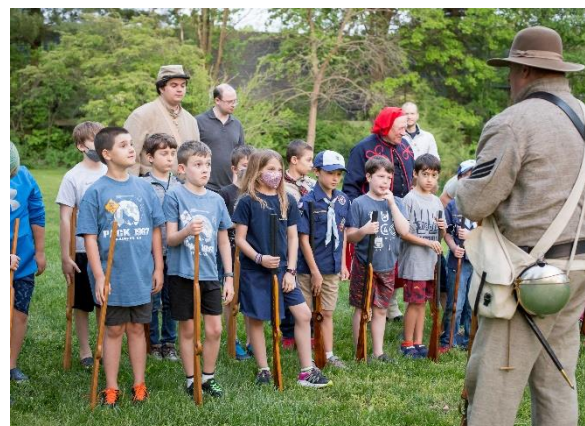
Fairfax Rifles Scout Line