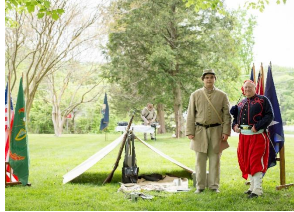
Union Zouave and Confederate Soldier