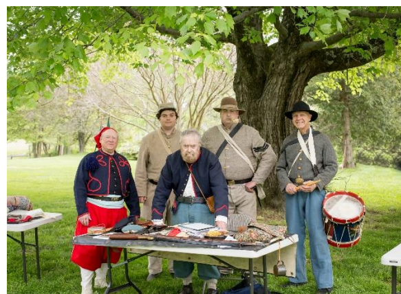
Fairfax Rifles Soldiers