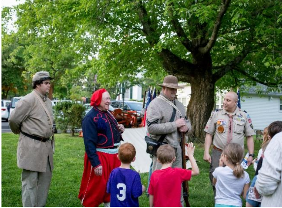
Fairfax Rifles and Cubmaster