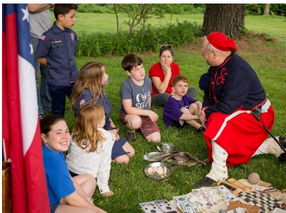
Fairfax Rifles Scouts and Zouave