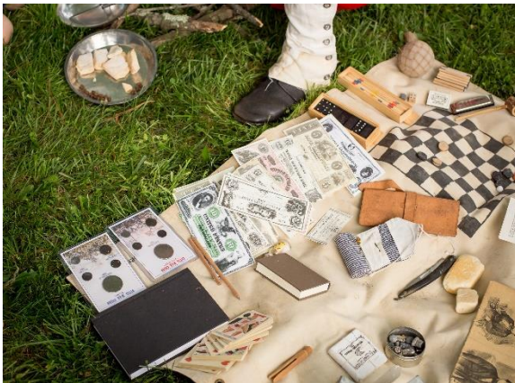
Fairfax Rifles Period Items