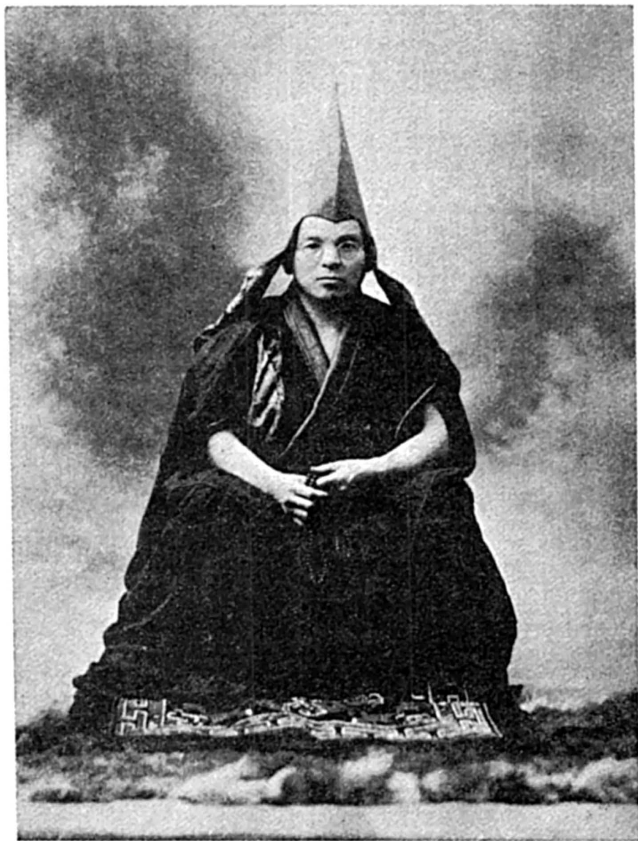
THE LAMA YONDGEN