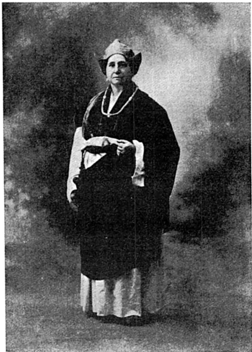
ALEXANDRA DAVID NEEL Wearing her monastic robes in Tibet