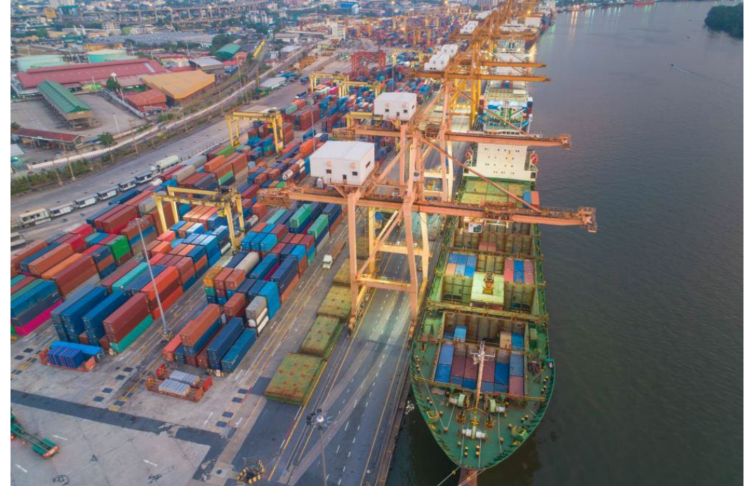
Waste shipments - European Commission