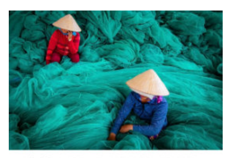
LOSS AND DAMAGE FUND: A PARTICIPATION BLUEPRINT