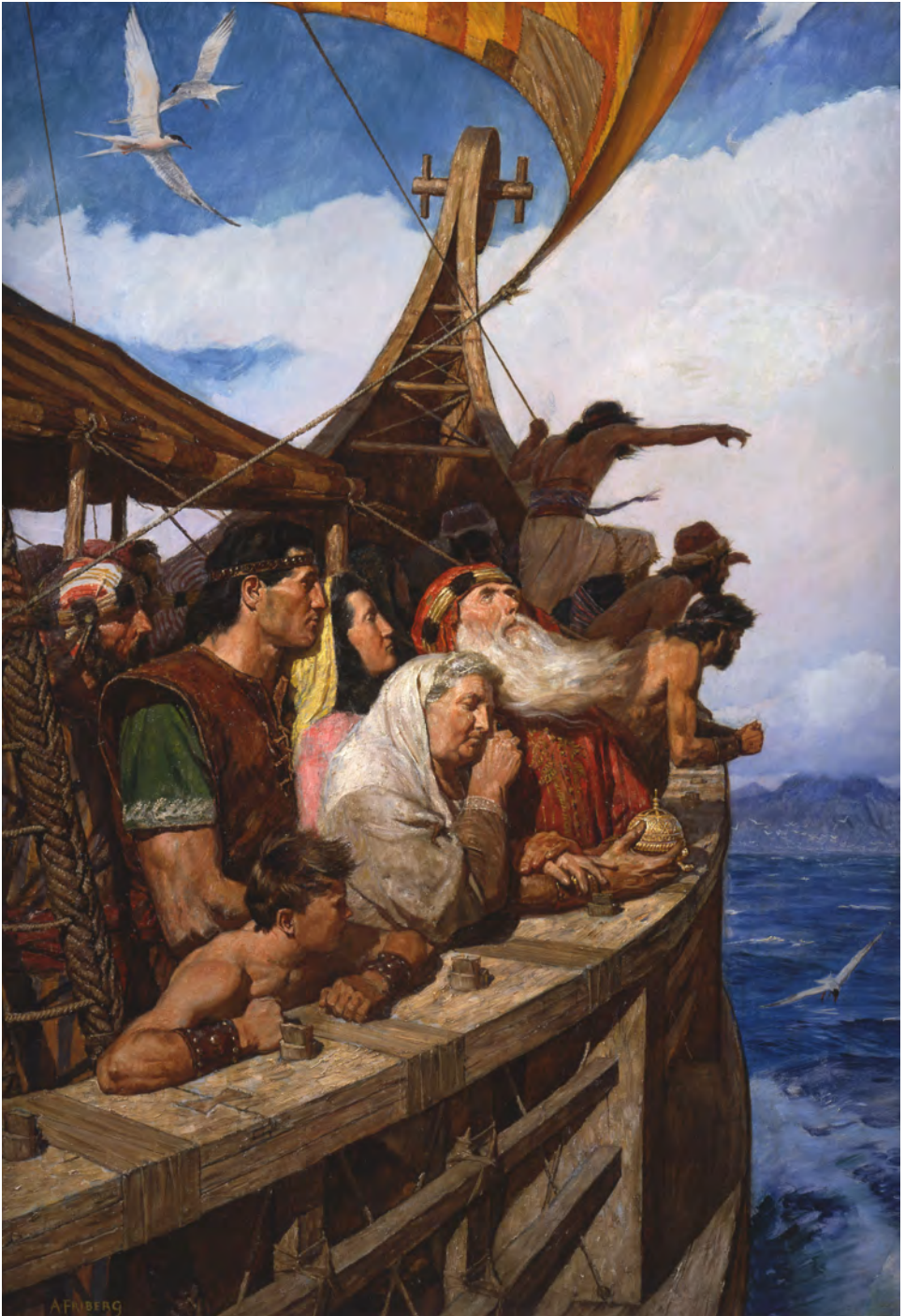
Lehi and his people arrive in the promised land Painting by Arnold Friberg