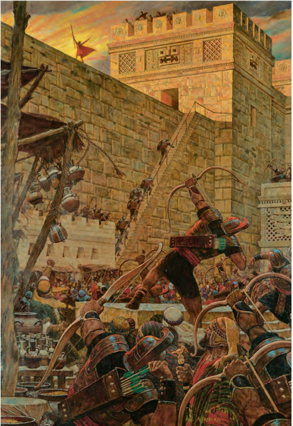
Samuel the Lamanite prophecies Painting by Arnold Friberg