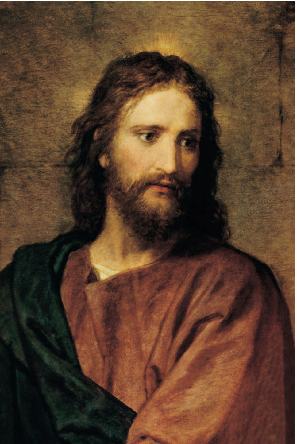
The Lord Jesus Christ Painting by Heinrich Hofmann