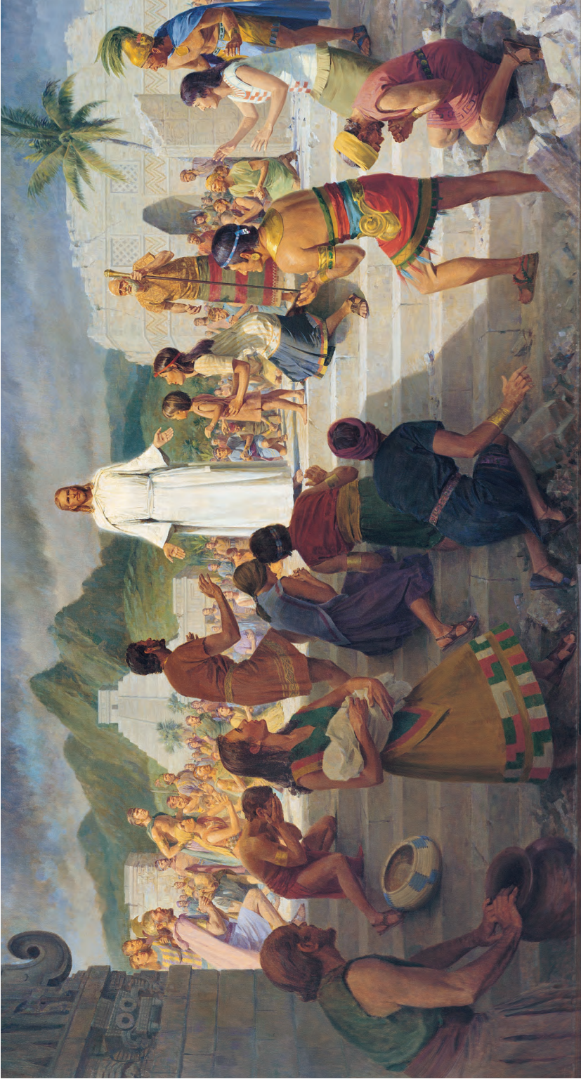
Jesus Christ visits the Americas