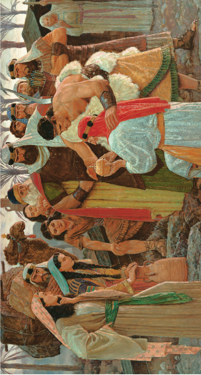
Lehi discovers the Liahona Painting by Arnold Friberg