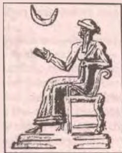
The Babylonian Moon-aod