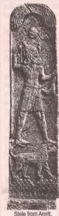
Stele from Amrit.

As a matter of fact, everywhere in the ancient world the symbol of the crescent moon can be found on seal impressions, steles, pottery, amulets, clay tablets, cylinders, weights, earrings, necklaces, wall murals, and so on. In Tell-el-Obeid, a copper calf was found with a crescent moon on its forehead. An idol with the body of a bull and the head of a man has a crescent moon inlaid on its forehead with shells. In Ur, the Stela of Ur-Nammu has the crescent symbol placed at the top of the mister of gods b@caul@ th@ moon god was the head of the gods. Even bread was baked in the form of a crescent as an act of devotion to the moon god. 6