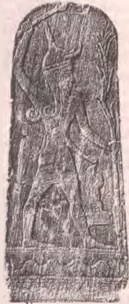
~Y Stele from Ras Shamra, North Syria