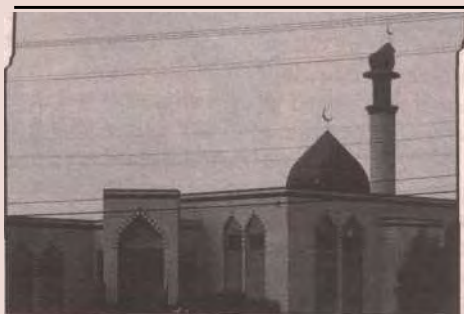
Islamic Mosque in Columbia, Missouri

The Arabs worshiped the moon god as a supreme deity. But this was not biblical monotheism. While the moon god was greater than all other gods and goddesses, this was still a polytheistic pantheon of deities. Now that we have the actual idols of the moon god,