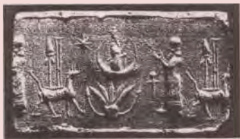
Late Assyrian or Neo-Babylonian Seal. Baltimore, Walters Art Gallery

The Sumerians, in the first literate civilization, left thousands of clay tablets describing their religious beliefs. As demonstrated