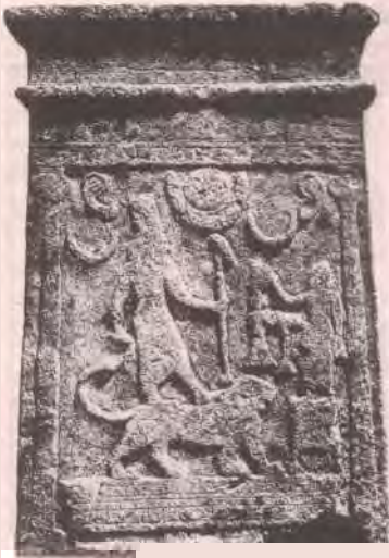
An Egyptian monolith

ously loath to preserve traditions of earlier paganism and like to garble what pre-Islamic history they permit to survive in anachronistic terms." 8