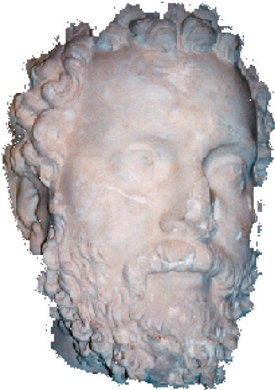
Bust of Septimius Severus in the Granet Museum, Aix-en-Provence.

According to the highly unreliable Historia Augusta (written in late antiquity), when Severus (born in North Africa and Emperor of Rome 146-211 AD) encountered a black man widely reputed to be a buffoon, he was not amused, but considered the meeting an ill omen. He urged his priests to consult the organs of a sacrificial animal, which they also found to be black. Not long after, he died. There are some grounds for believing that Severus himself may have been black. See also note on the Triumphal Arch of Septimius Severus, on p. 38.