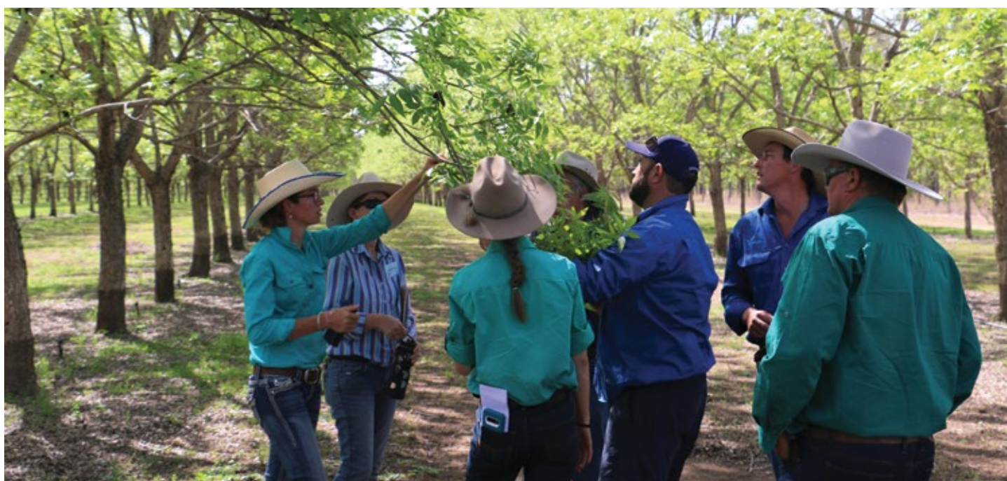
Producers inspecting pecan plantation near Munduberra at a field day hosted by the Central Burnett Landcare Group.