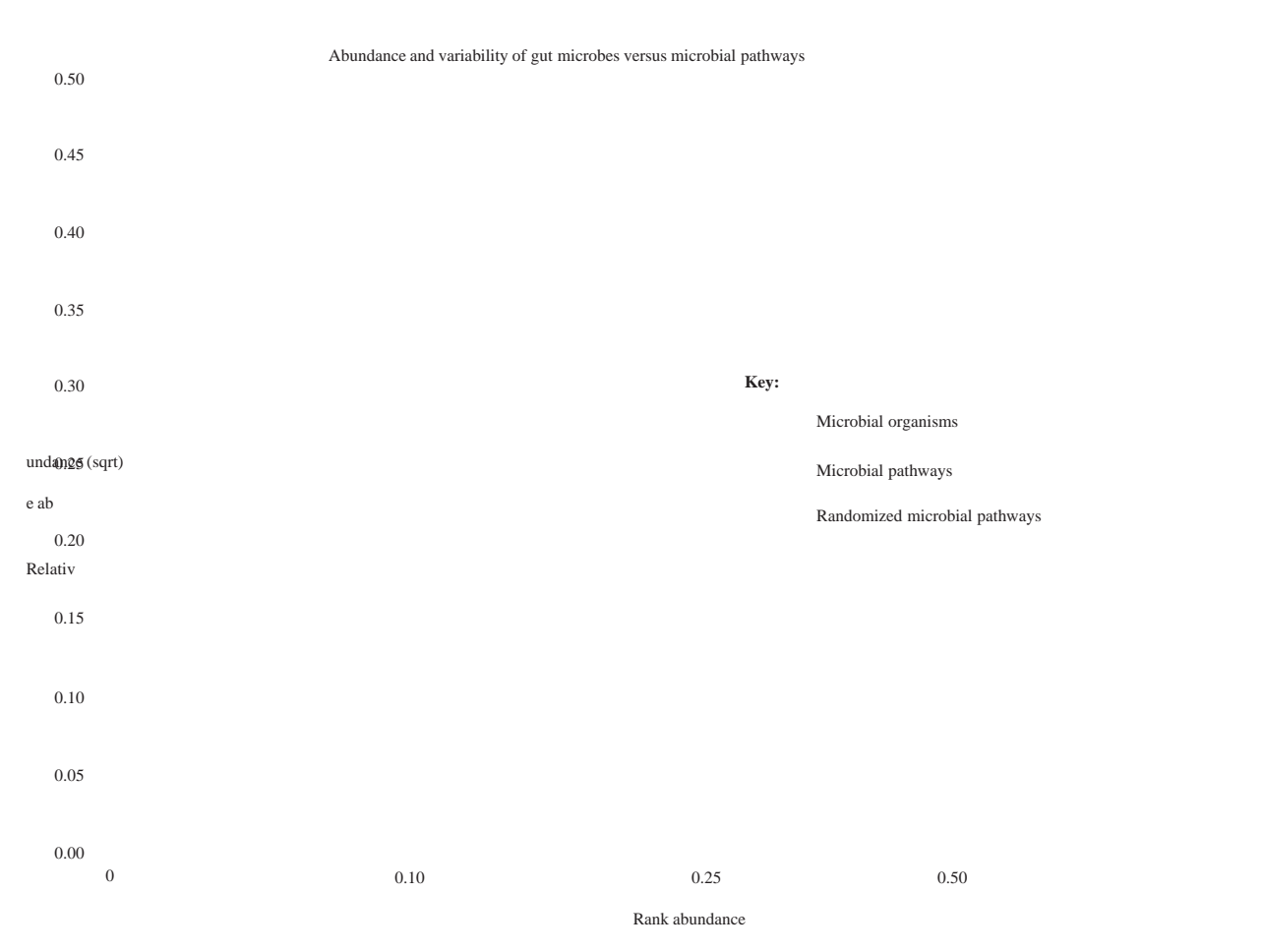
Figure 2. The core gut microbiome consists of stable pathways present despite variation in microbial abundances. Profiles of 118 stool samples from healthy individuals, showing the relative abundances of microbial organisms (red), inferred microbial pathways [70] (green), and microbial pathways after randomization (blue, all data from [1]). All relative abundances are shown as median and interquartile range across all

Börnigen et al. Genome Medicine 2013, 5:65 http://genomemedicine.com/content/5/7/65