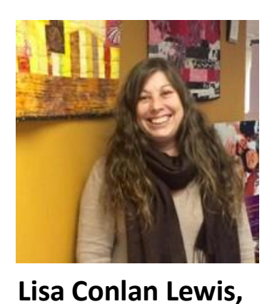
CPRS Executive Director Parent Support Network of Rhode Island