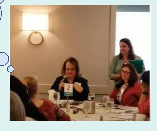
2019 RIPIN Policy Forum: Access to Care

"All my child did is do what he was supposed to do....Grow Up."